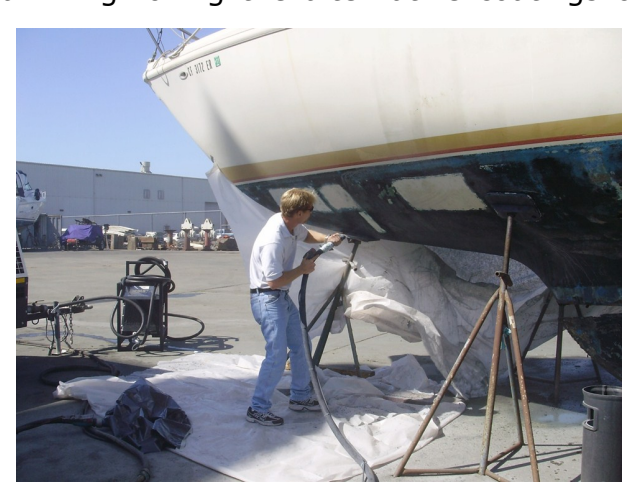
rather than spraying.

IRTA is analyzing alternative ed. point and are less costly. IRTA is also ex-boat. amining rolling the alternative coatings on